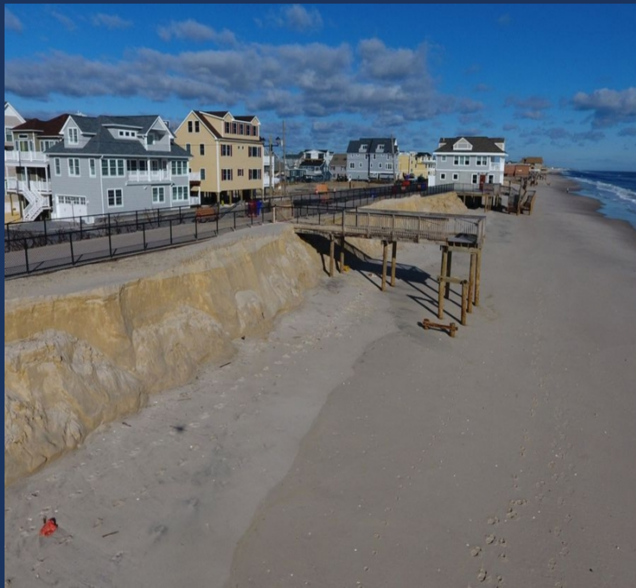
Pictured: Jersey Shore beach eroded due to Winter Storm Sandy.

Beach Erosions can be described as loss of sand due to wind and water movement. Sand can be transferred deeper in the water or can come up shore onto open roads. The movement of the sand can cause beaches to appear to have lower, scattered levels of sand. Storms in New Jersey have led to severe erosion on beaches, as well as destruction to boardwalks, homes, and businesses. Beach Erosions are very dangerous and have the power to leave permanent impacts wherever they hit.